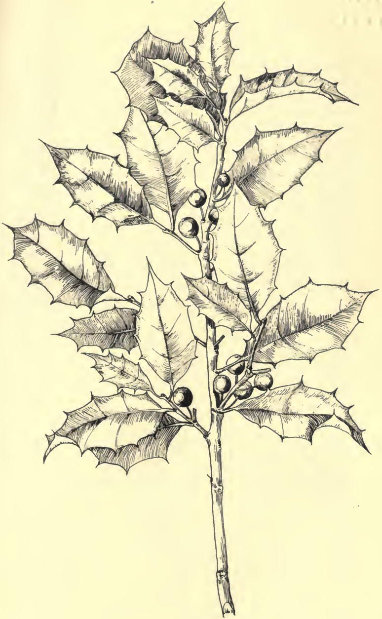
AMERICAN HOLLY ( Ilex opaca )