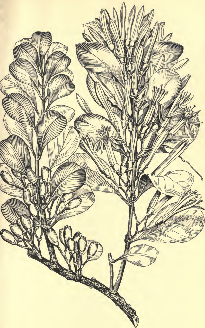
A TROPICAL MISTLETOE ( Psittacanthus dichrous ) After Martius, Flora Brasiliensis , Vol. V, Plate 5 (1848)