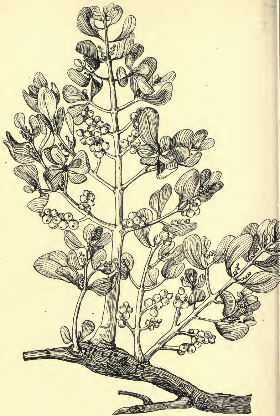
AMERICAN MISTLETOE ( Phoradendron flavescens ) About one-third natural size