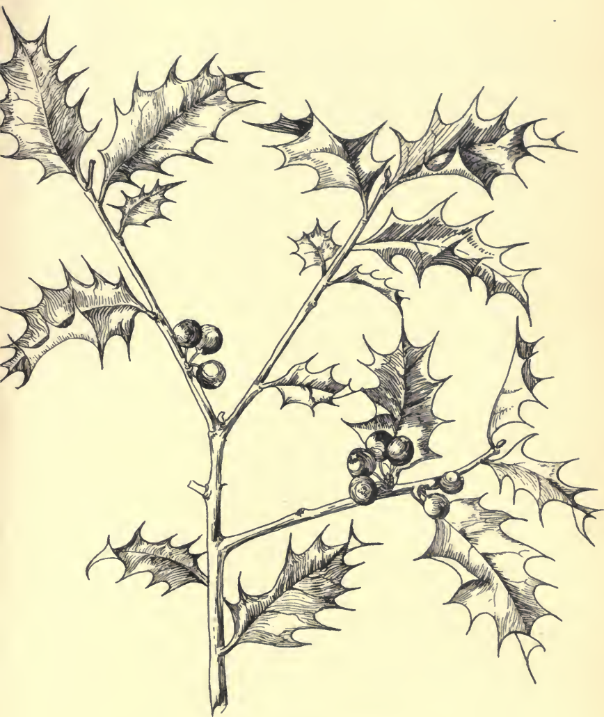
EUROPEAN HOLLY ( Ilex Aquifolium )