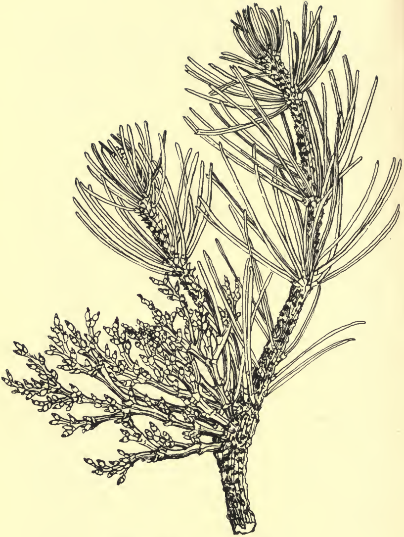
PINE MISTLETOE ( Arceuthobium divaricatum ) Natural size