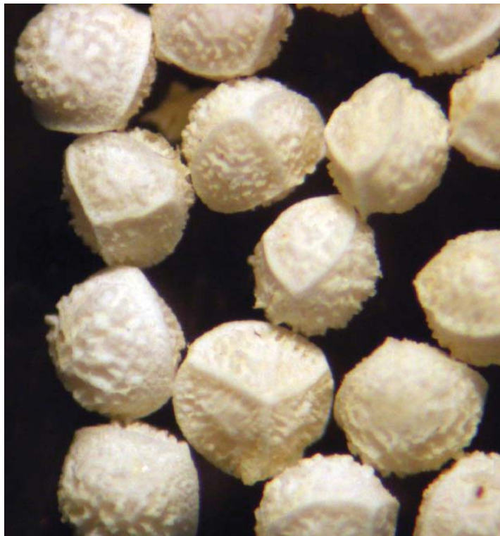
Megaspores showing trilete markings on the proximal face.