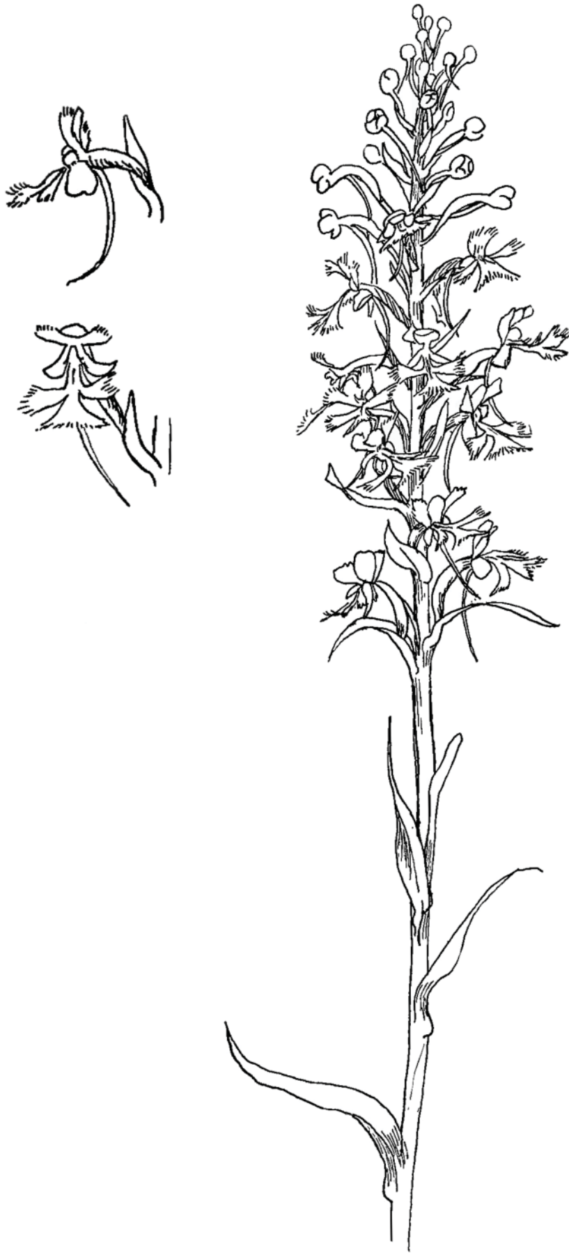
SMALL PURPLE FRINGED ORCHID: Platanthera psychodes .