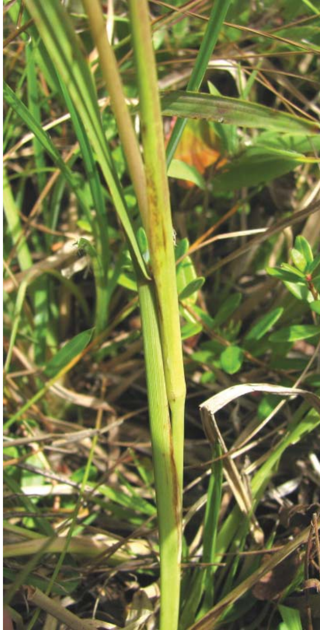
Culm and sheath of P. rigidulum ssp. pubescens

Hairy Stiff-leaved Panic-grass ( Panicum rigidulum ssp. pubescens ), a regionally rare grass, was found growing in a moist field in South Kingstown, RI near the Pettaquamscutt River. This grass has compressed or flattened stems (culms) and spikelets on short pedicels. It is generally found in moist meadows or pond edges.