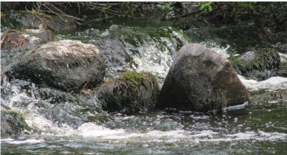
Habitat of Podostemum