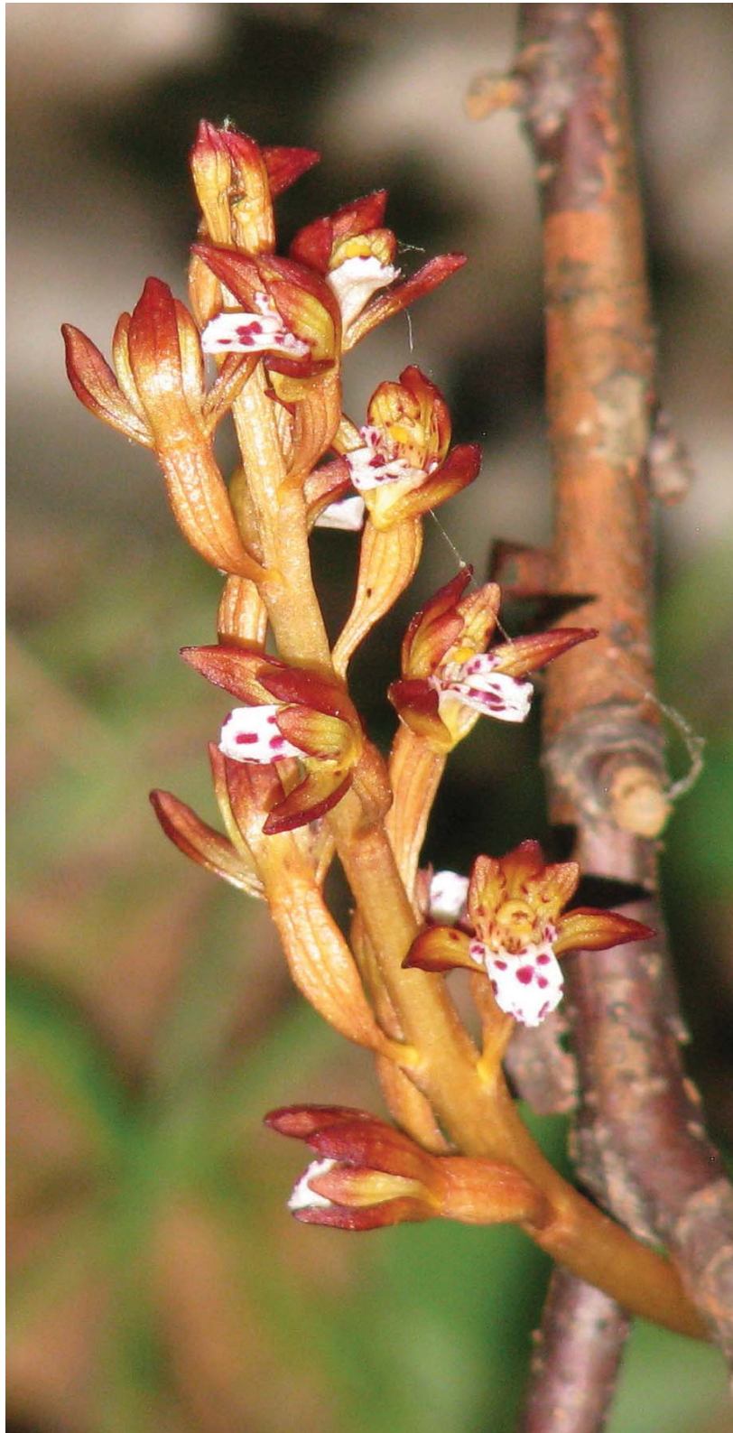
Western Spotted Coralroot ( Corallorhiza maculata var. occidentalis )