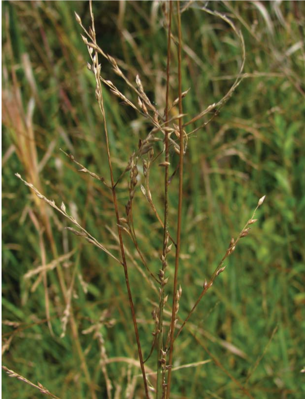
Panicum rigidulum ssp. pubescens